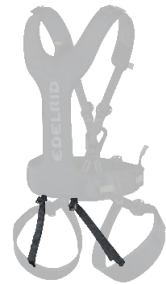
82043 Spare Bumstraps Radialis Pro Adjust