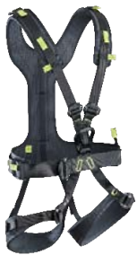
82046 Radialis Pro Adjust