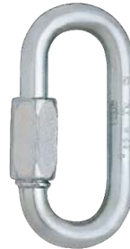
73798 Screwlink 10mm