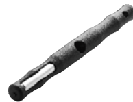
76042 Smart Belay X Opener