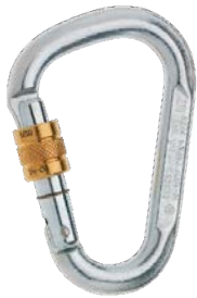
88291 Steel HMS Screw