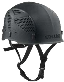
72049 Ultralight III