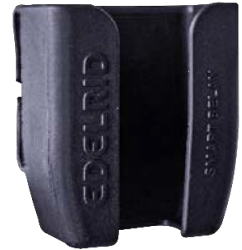
76044 SBX Holster