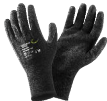
89011 Grip Glove