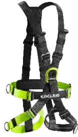
74923 Radialis Air III