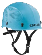
72050 Ultralight Junior III