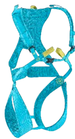
74908 Fraggle III