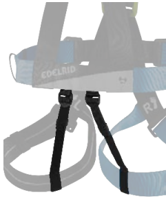
74936 Spare Bumstraps Radialis Comp