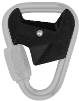
85212 Triangle Captive