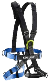
74926 Radialis Comp Junior III