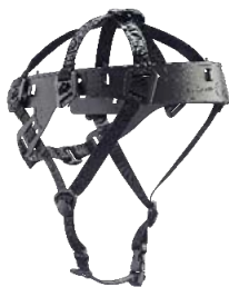
72056 Ultralight Junior Carrying System III