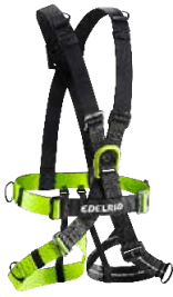
74925 Radialis Comp III