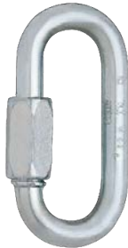
73806 Screwlink 8mm II