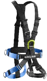
74924 Radialis Air Junior