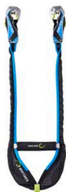
SMART BELAY X

With our modular elements, the Smart Belay X can be individually adapted to the needs of your park.