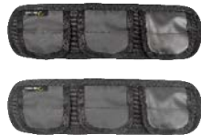
74339 Additional Radialis Padding